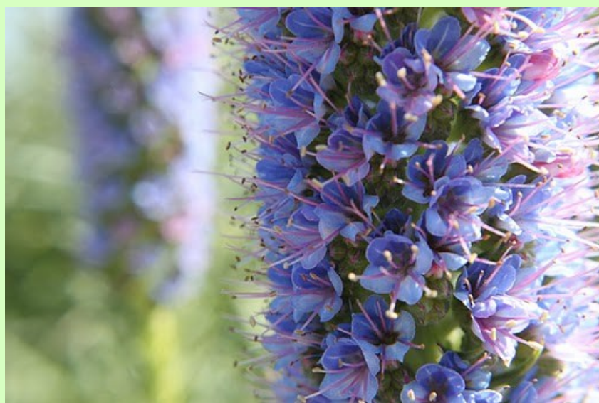
"Lavender-A Spring Time Beauty"