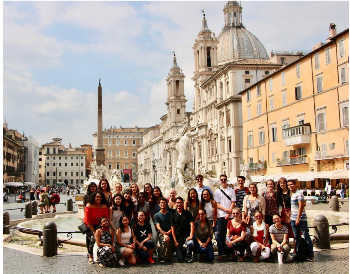
Revelle in Rome Global Seminar