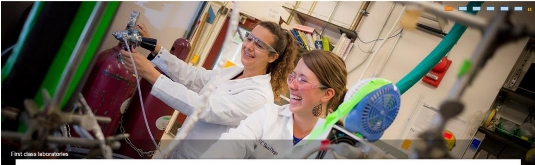
First class laboratories

Where sciences, arts, and humanities join to inspire and educate Renaissance men and women