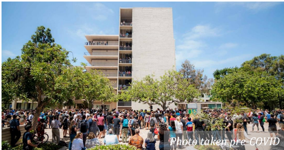
Photo taken pre-COVID