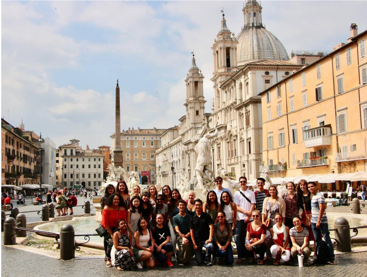
Revelle in Rome Global Seminar (Photo Taken Pre-COVID)