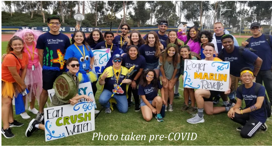
Photo taken pre-COVID