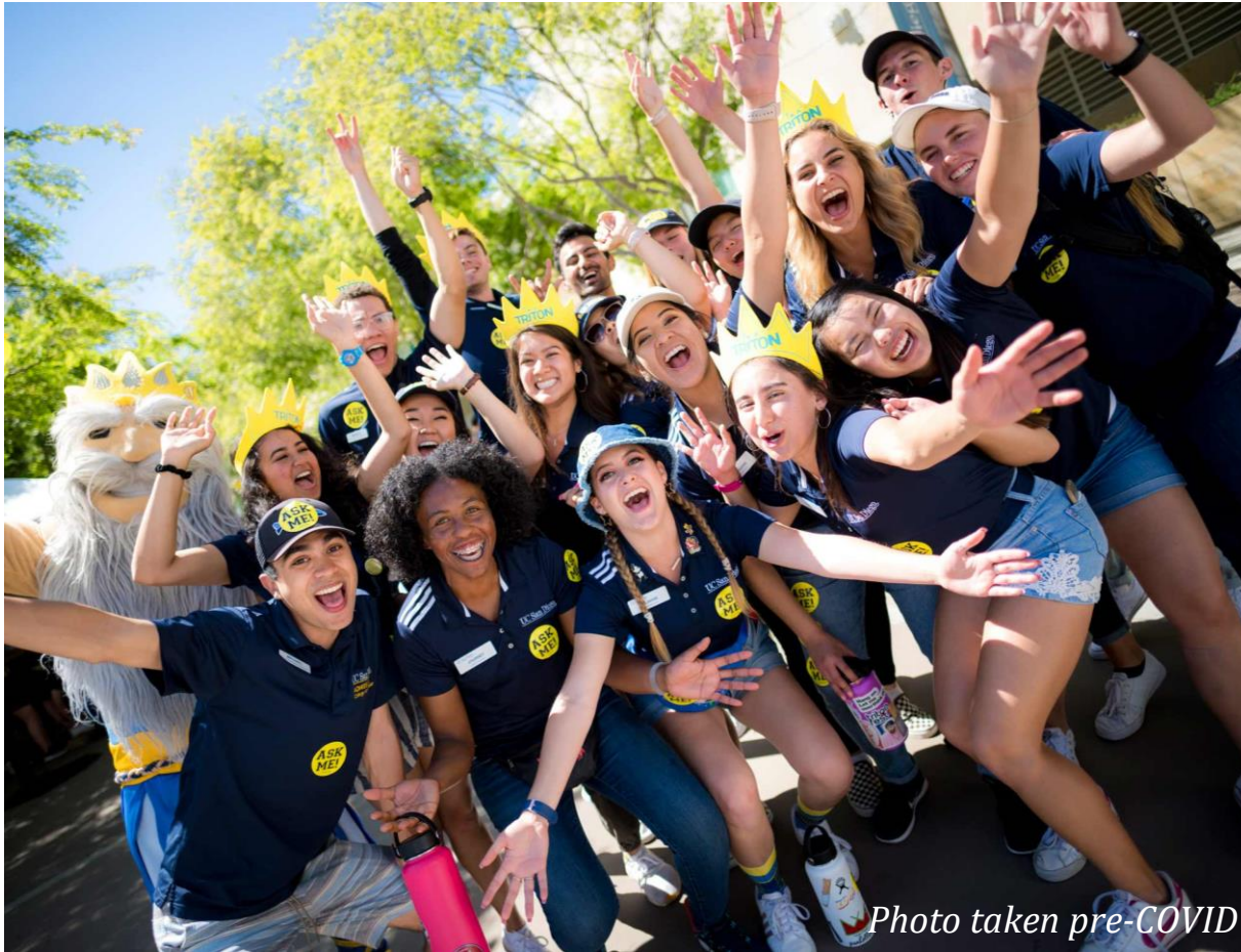
Photo taken pre-COVID