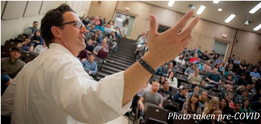
Photo taken pre-COVID

First Day of Classes – Thursday, September 23