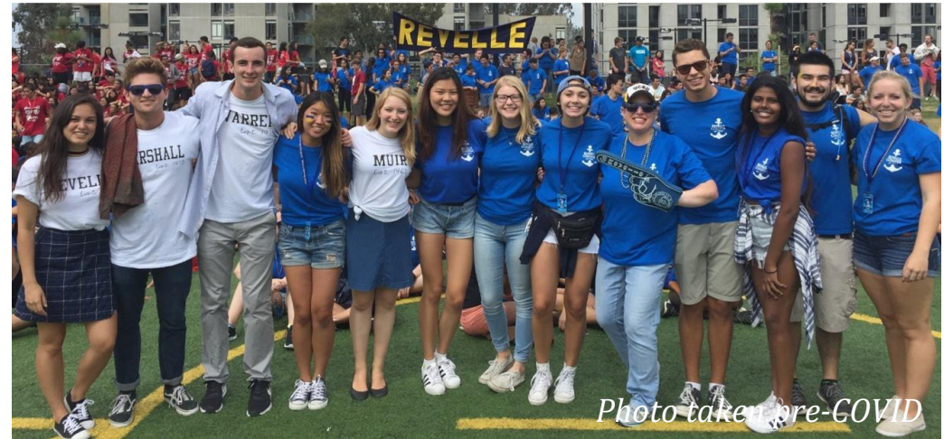
Photo taken pre-COVID